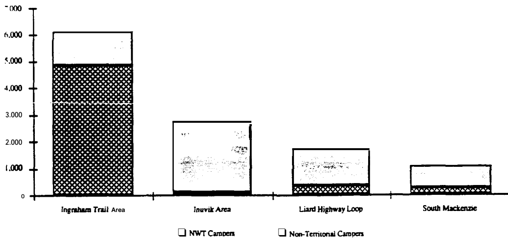
Figure 2 Group Nights by Area