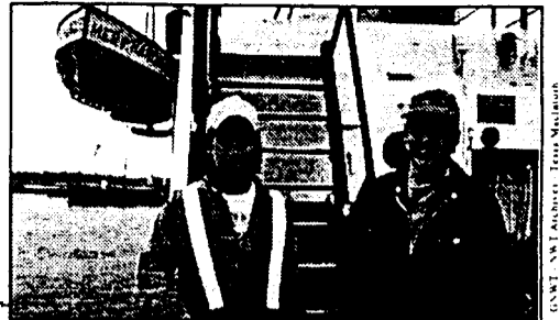
Deck Hands, Fort Providence Ferry, 1991