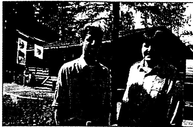
Parks Officers at Blackstone Park, Fort Liard, 1993.