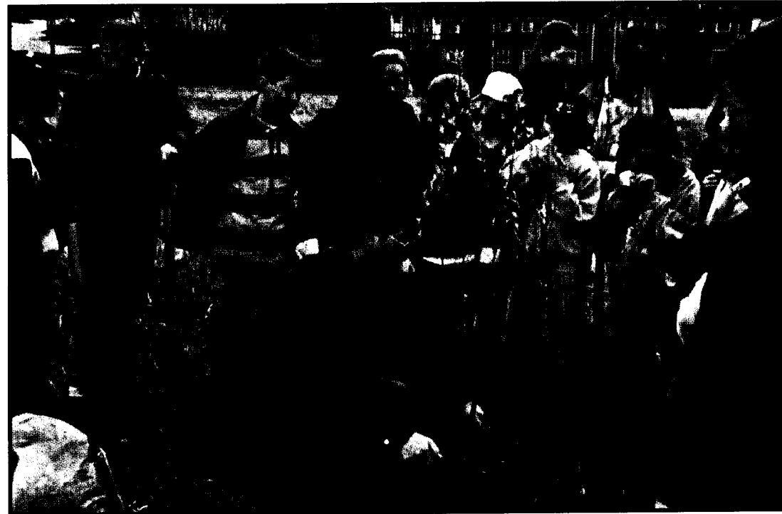
Youths dedicated in environmental prosperity.

The "environment first" policy In response to the community's fears about the environment, the municipality adopted a by-law in 1989 applicable to both businesses and private individuals. The purpose of the by-law was to encourage community members to ensure that their behaviour and activities were consistent with sustainable development. Over one hundred new practices have since been adopted in more than fifteen areas, including energy resources, reduction of pesticide use and composting. In short, this is another major success story that the Federation of Canadian Municipalities and Environment Canada can point to with pride.