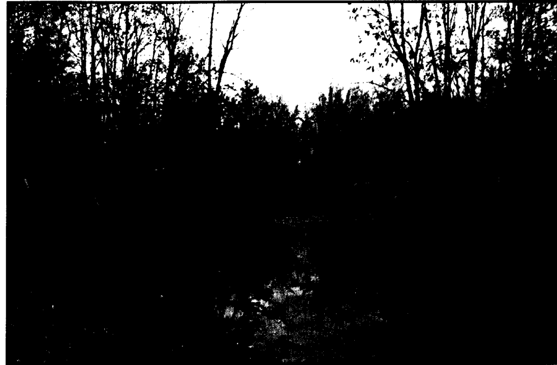
A successful clean-up operation.

This success story shows how effectively governments, municipalities, private enterprises and citizens can work together. One can only hope that other Canadian communities will emulate this project. Knock on wood!