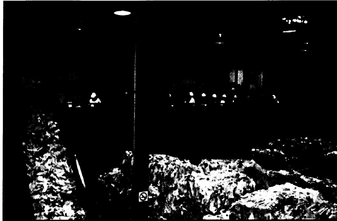
CFER - Recycling and training center work hand in hand.

The driving force behind any environmental initiative is the determination of community members to work together to improve the quality of their environment. This determination has been in evidence in Victoriaville since 1990. Environment Canada and the Federation of Canadian Municipalities are proud to report this success.