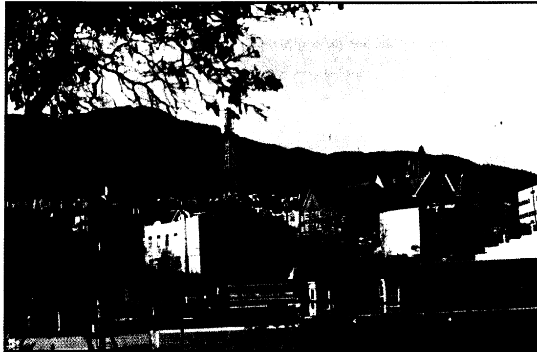
Downtown Nanaimo, British Columbia.

Programs to ensure sound municipal infrastructure and a healthy environment at the local level help municipal governments to clean up the environment and guarantee that future generations are equipped to maintain high environmental standards. The following programs are specifically directed at municipal governments to provide resources for them to protect the environment in their own communities.